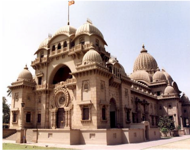
Temple at Belur Math, INDIA Head Quarters, Ramakrishna Mission

"He who has served and helped one poor man, seeing Siva in him, without thinking of his caste, creed or race or anything, with him Siva is more pleased than He is with the man who sees him only in Temples"