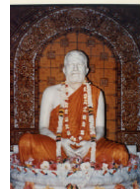
Bhagwan Sri Rama Krishna at Belur Math, West Bengal, India

The Sevashrama needs your support today to continue its daily activities