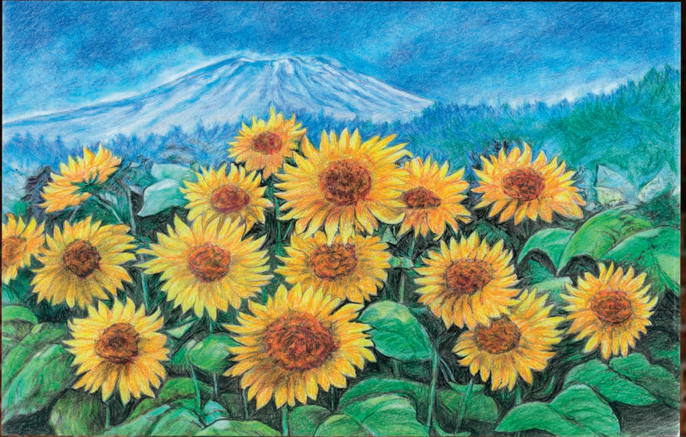
Fuji-Sunflower, by Arakawa Saburo